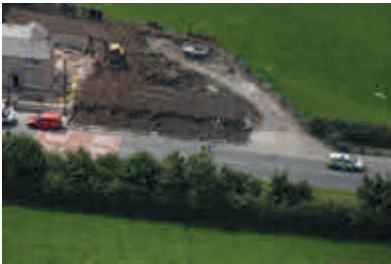
Aerial view of the scene of the wall collapse

The director of a building firm has been jailed for two years after a substandard wall collapsed killing a three-year-old girl. He was found guilty of gross negligence manslaughter. An investigation by police and the Health and Safety Executive found that the wall had been acting as a retaining wall but had not been