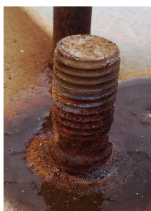
19mm shank stud

studs. A visual survey was carried out to identify the presence of 19mm shanks on studs at other sites with similar beams and a number were found.