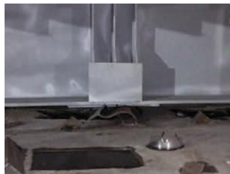
Remains of the supporting beam