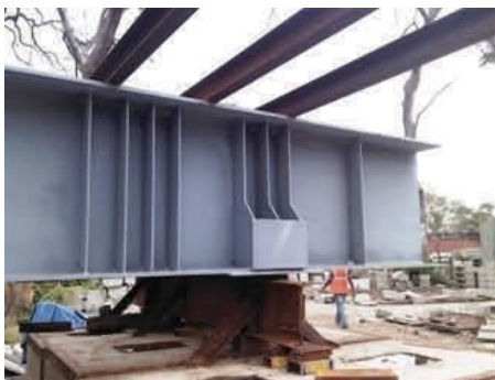
Test load setup