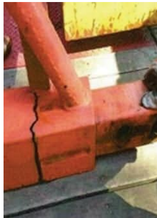
Crane in position