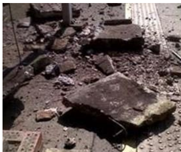
560 Fallen concrete encasement

560 A 4.5m length of concrete encasement was detached from a bridge soffit and fell onto a public area. Fortunately, no one was injured, but clearly the incident could have caused a fatality. The root cause was corrosion of the reinforcement after cracking of the concrete, but differential temperature between the metal beam and concrete had a part to play in the final failure – around that time a temperature of 34°C was recorded.