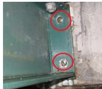
561 Missing bolts

561 A report was received from a Local Authority about a fracture in a footway attached to the side of a main bridge structure. The footway was supported on cantilevered members and it was found that of the 8 bolts holding these in place 4 bolts had fallen out.