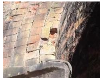
553 Spalling masonry

553 A member of the public contacted authorities to report masonry falling from a bridge. It was found that weathering in the form of repeated freeze/thaw cycles was responsible. This is a high bridge in an urban area with a pavement underneath so persons could have been hit by debris.