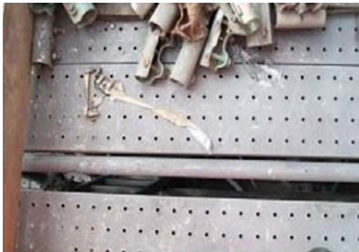
571 Tube fell through this gap

It was reported that work was taking place to refurbish the roof of a large publically accessible area. Two scaffolds had been erected to enable this to happen: a high level working platform that gave access to the roof, and a lower level scaffold to support a protective deck. Whilst operatives were in the process of installing roof sheeting above part of the area a 2.4m long standard tube that had been stored on the walkway on the high level scaffold moved. It fell through a gap in the scaffold planks then struck and penetrated the protective decking below. Two children on the concourse received slight injuries.