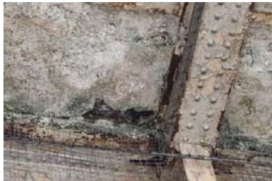
549 Spalling concrete

549 A member of the public reported that he was hit by falling concrete from an underbridge. Responsibility for the bridge was in a "grey" area between two owners and the organisation concerned recommended that clear and transparent demarcation is required for all assets where maintenance liability is shared. Where defects are identified on grey assets then liaison between liable parties should be carried out to ensure risks are managed appropriately.