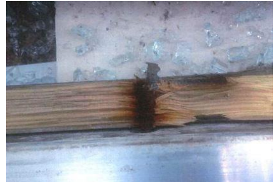
Figure 3: Rusted screws used to fix the balustrade support rail

A firm was asked to provide professional advice regarding the replacement of a glass balustrade which had collapsed. The balustrade was at second floor level, free standing in a prefabricated metal channel section which was inadequately fixed down to softwood decking boards. It is a single occupancy domestic property and all glass and debris fell within the grounds of the property. No one was injured. The reporter asks if the firm have an obligation to report the incident to the HSE or any other organisation?